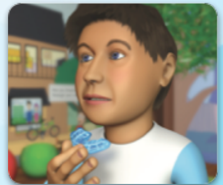
Myofunctional Orthodontic treatment for ages 3-15.