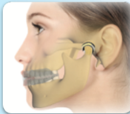
Immediate diagnosis and treatment of TMJ Disorder.